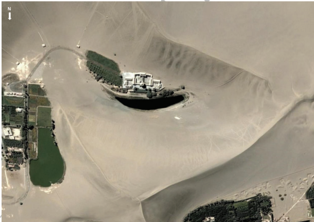
Figure 2. A bird's eye view of the Crescent Moon Spring and adjacent sand dunes (source: Google Earth, image taken on August 29, 2007). The dunes grow in a pyramidal shape and have three arms that radiate outward from a central peak. The arrangement of the dunes around the spring produces an approximately east-west valley in which the pond lies. The regional winds are channeled by the local landforms into a mainly eastward direction. These local winds blow the sand uphill.

The spring has been one of the eight major tourist attractions in Dunhuang since the Eastern Han Dynasty (25 B.C. to 220 B.C.). Other attractions include the Mogao Grottoes and Western Thousand Buddha Cave, which contain sculptures and cave paintings from the fourth to the fourteenth century. Countless Chinese and foreign