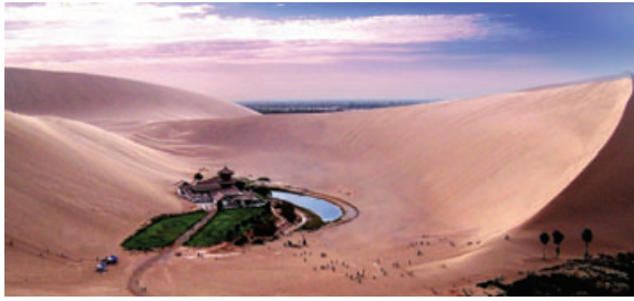
Figure 1. A general view of Crescent Moon Spring and the surrounding Singing Sand Mountain. The Crescent Moon Spring has existed in this same location at least for thousands of years and remains a tranquil sanctuary from the harsh winds and blowing sands of the surrounding dunes. The camera faces approximately west (photo by Jianhua Yang on August 10, 2004).

during the Tang Dynasty (618 to 917) Li 813. This record mentions that the water was pure and sweet.